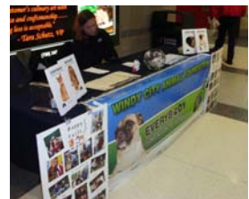
The Windy City Booth at the Blackhawks Game

For now, we'll be cheering loudly for our home team in the playoffs, in solidarity for the way they give back to Chicago animals in need. Woof-Woof! Meow!