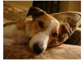
Sparrow, Home at Last!

toy, her silly self just enjoying a squeaky massage. She's easily learned to sit, down, stay, come, and will wait at the door until invited to go out. Her best move is the "Baby Slide" where she stretches out her back, with her front paws down, then slides forward all the way, with her little legs splayed out behind her. So cute! She's our girl and we feel lucky that she's ours!" Windy City couldn't agree more.