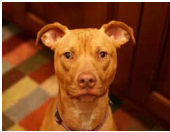
Lola, SERIOUSLY looking for her forever home!

You may remember Lola. This beauty has been featured in Pawsonalities before. In fact, Lola has been with Windy City for almost a year! You see, Lola came to us as a 6 month old puppy. This adorable little viszla / pit mix was begging for rescue, and we were happy to oblige. She found a lovely home and we were very happy for her.