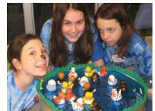
Students gather at the "Canine Carnival"